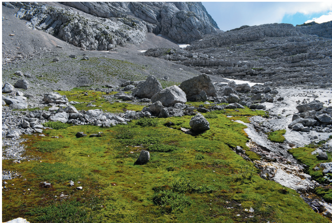
Figure 6: Large spring areas near Lake below Vršac (Jezero pod Vršacem), stands of the subassociation Saxifraga robustae-Palustrielletum commutati saxifragetosum sedoidis .

The spring communities discussed in this article belong to Natura 2000 habitat type 7220* Petrifying springs with tufa formation ( Cratoneurion ). To date, they have not yet been subject to comprehensive research in the Slovenian Alps. Together with recently published relevés (DAKSKOBLER & MARTINČIČ 2021) our relevés fill a small gap in our knowledge of these communities. For the main part they are not directly threatened by human impact, even though some of these springs are situated near roads (Mangart) and areas that are very popular in the summer (Prehodavci, Mangart), whereas others (the Mlinarica, ledges of Mt. Kanjavec, Upper Kriško Lake / Zgornje Kriško Jezero) are found in very remote areas. The main threat factors are grazing of small ruminants, popular mountain trails in the vicinity, climate and hydrological change, and eutrophication (DAKSKOBLER et al. 2021).