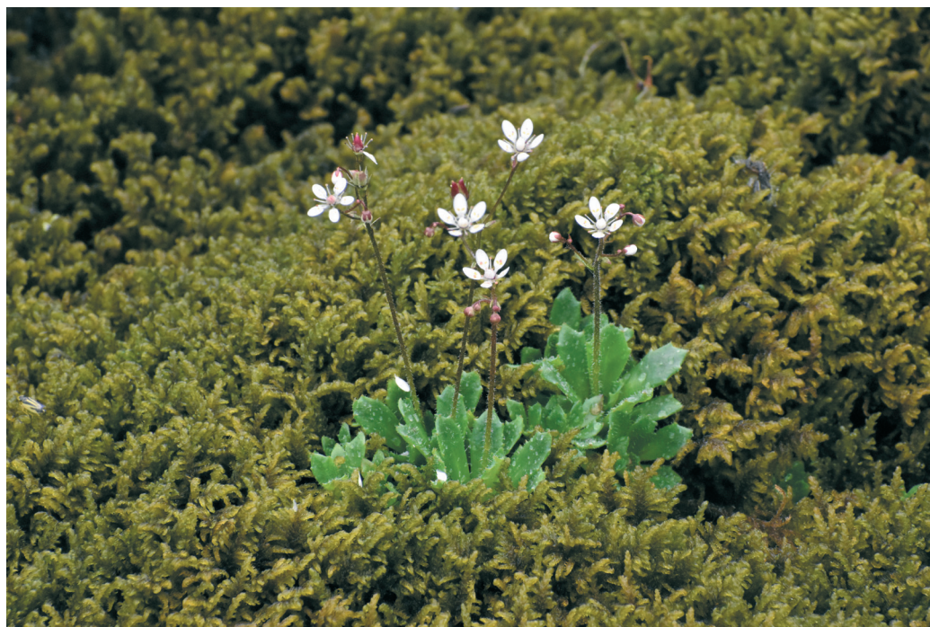
Figure 4: Stand of the association Saxifraga robustae-Palustrielletum commutati , detail. Slika 4: Sestoj asociacije Saxifraga robustae-Palustrielletum commutati , detajl.

E. PIGNATTI & S. PIGNATTI (2014, 2016) published tables for both associations, Cratoneuretum commutati and Cratoneuretum falcati , for the Dolomites. In our comparison we took into account the table of the association Cratoneuretum falcati , which is comparable with our relevés. The authors selected Palustriella commutata (incl. var. falcata ), Arabis soyeri ( A. jacquinii ), Saxifraga stellaris (it has a 45% frequency in the table with 11 relevés), Philonotis calcarea and Bryum schleicheri (the latter two with constancy values below 20%). Frequent species with frequency values higher than 50% (or just below) include Epilobium alsinifolium , Cardamine amara , Deschampsia cespitosa , Alchemilla glabra , Agrostis stolonifera , Viola biflora and Ptychostomum pseudotriquetrum ( Bryum pseudotriquetrum ).