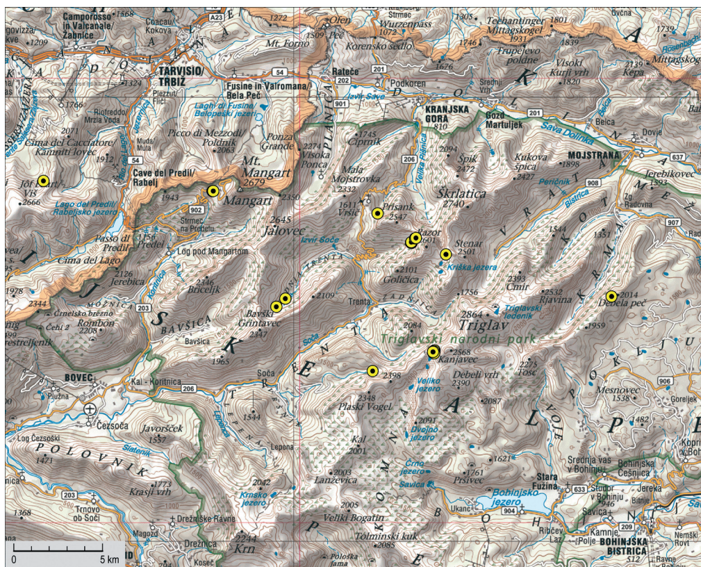
Figure 1: Approximate localities of researched stands at springs in the subalpine and alpine belt of the Julian Alps. Slika 1: Približna nahajališča preučanih sestojev ob izvirih v subalpskem in alpskem pasu Julijskih Alp.

method – UPGMA and Wishart's similarity ratio. We transformed the combined cover-abundance values into ordinal scale (1–9) according to van der MAAREL (1979). Numerical comparisons were performed with the SYN-TAX 2000 program package (PODANI 2001). In the classification of species into phytosociological groups (groups of diagnostic species) we mainly refer to the Flora alpina (AESCHIMANN et al. 2004a, b), ZECHMEISTER (1993), TOMASELLI et al. (2011) and HINTERLANG (2017), but rely also on our own experience.