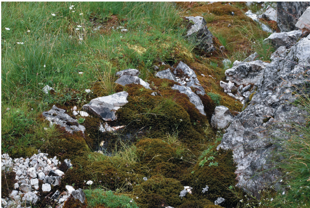
Figures 2a, b: Springs near Lake below Vršac (Jezero pod Vršacem) (above), and in the Mlinarica valley (below); the sample plot is limited with moist (spring) surface.

Slika 2a,b: Izvira pri Jezeru pod Vršacem (zgoraj) in v poviirju Mlinarice (spodaj), popisna ploskev je omejena z mokrotno (povirno) površino.