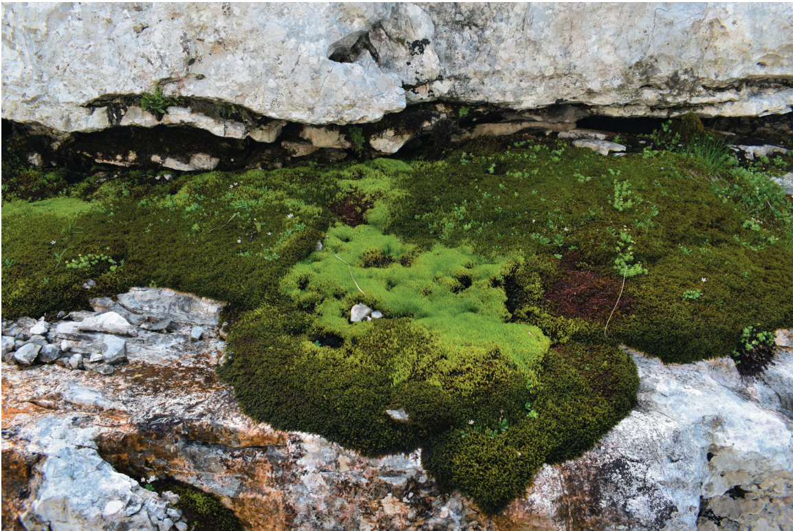
Figures 7a, b: Stands of the subassociation Saxifraga robustae - Palustrielletum commutati saxifragetosum sedoidis at Lake below Vršac (Jezero pod Vršacem).

Slika 7a,b: Sestoja subasociacije Saxifraga robustae - Palustrielletum commutati saxifragetosum sedoidis pri Jezeru pod Vršacem.