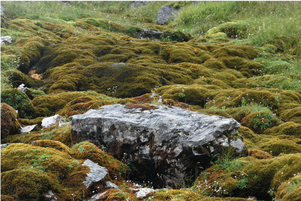
Figures 5a, b: Stands of the syntaxon Saxifraga robustae - Palustrielletum commutati violetosum biflorae var. Heliosperma pusillum , sources of the Mlinarica above the Trenta Valley.

Sliki 5a,b: Sestoja sintaksona Saxifraga robustae - Palustrielletum commutati violetosum biflorae var. Heliosperma pusillum v povirju Mlinarice nad Trento.