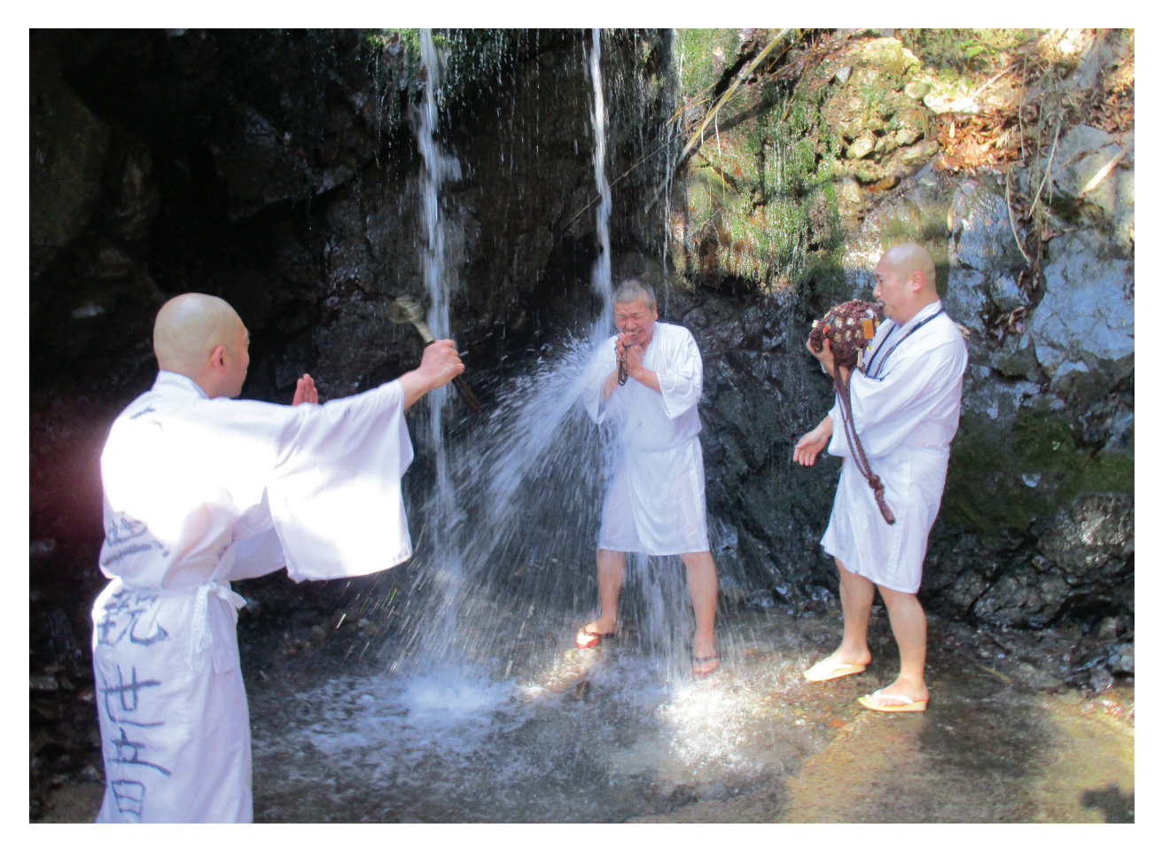
Photo 3: Meditation by sitting under a water fall in Manganji- Temple. Slika 3: Meditacija pod slapom v templju Manganji