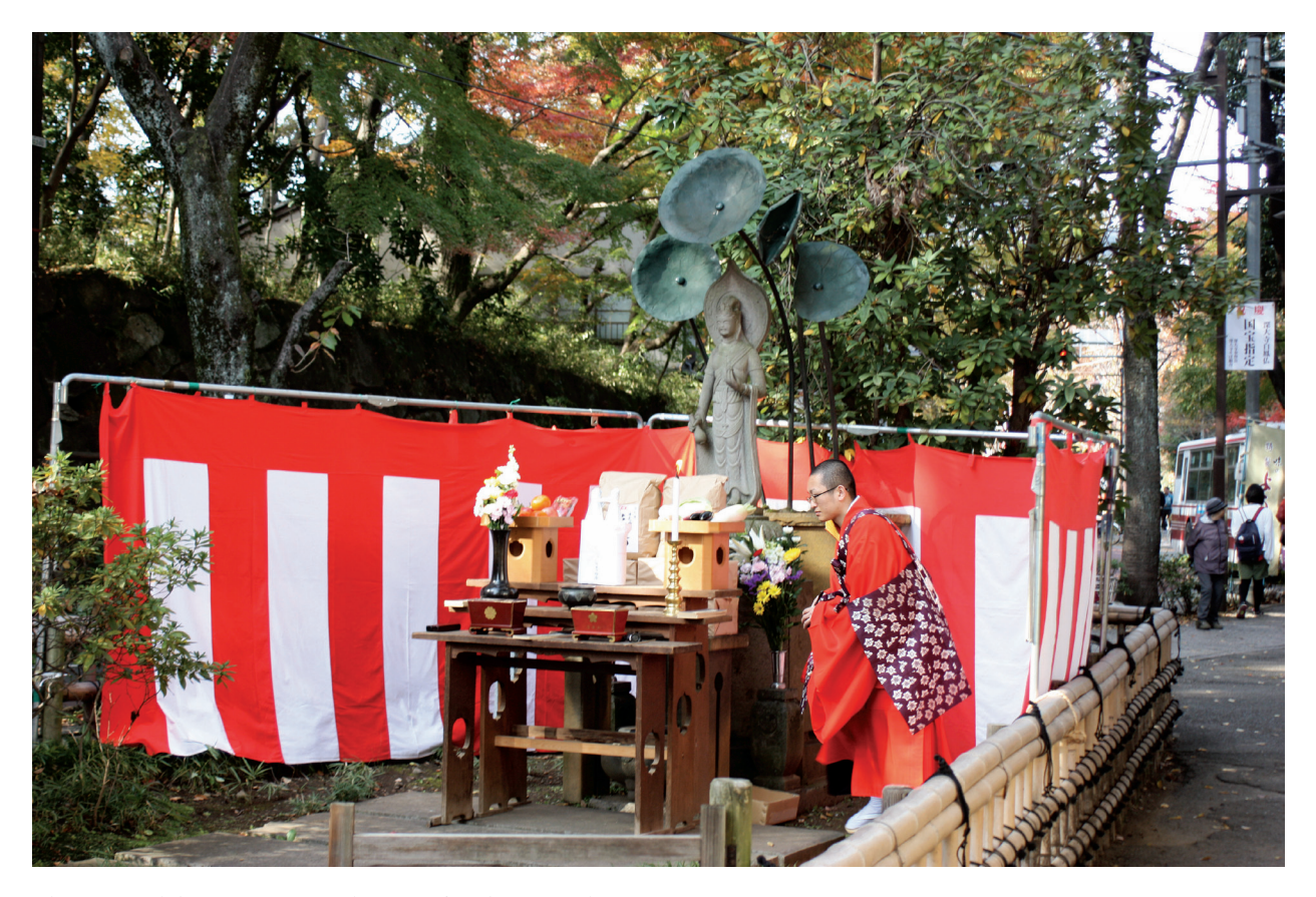
Photo 1: Avalokiteśvara in Temple town of Jindaiji-Temple. Slika 1: Avalokiteśvara v tempeljskem mestu templja Jindaiji

chapters of this Sutra, and he rescue people with troubles. And the owners of restaurants dedicated the Avalokiteśvara to wish thriving business or the safety of food for the temple (Photo 1). And they open the ceremony of dedication once a year in a buckwheat festival term of autumn.