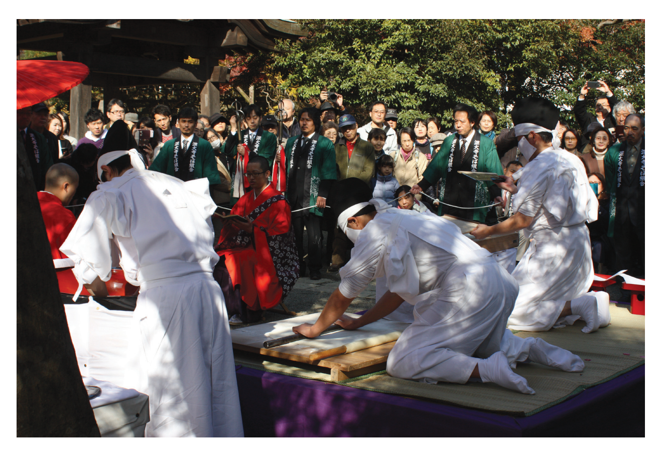
Photo 2: Dedication of making buckwheat noodles in front of the main hall of the Jindaiji -Temple Slika 2: Posvetitev izdelave ajdovih rezancev pred glavnim poslopjem templja Jindaiji