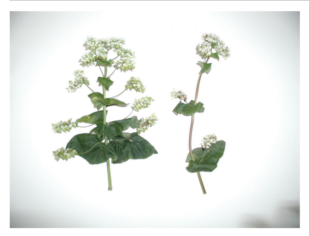
Fig. 11: Enhanced flower clusters Slika 11: Povečano število socvetij