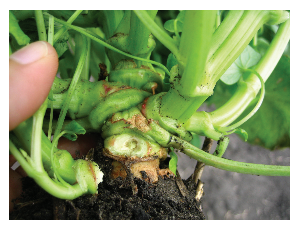
Fig. 5: Kiku has very short internodes at first Slika 5: Na začetku rasti so internodiji zelo kratki