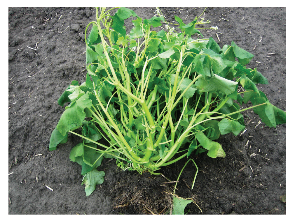
Fig. 4: Kiku branching habit Slika 4: Razvejanje pri rastlinah Kiku