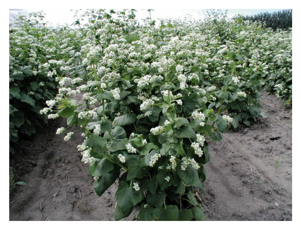
Fig. 12: Enhanced flower cluster plants Slika 12: Rastline z obogatenimi socvetji