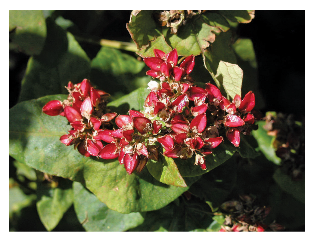
Fig. 17: Red pericarp Slika 17: Rastlina z rdečim perikarpom