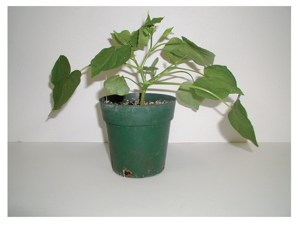
Fig. 8: Plant with early 'weed control' leaves Slika 8: Rastlina z obliko listov, ki zgodaj zasenčijo rast plevelov