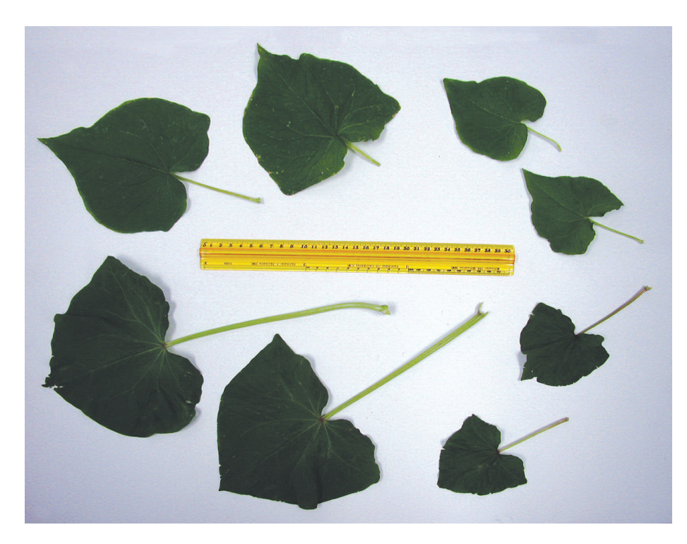
Fig. 2: Leaf sizes Slika 2: Velikosti listov