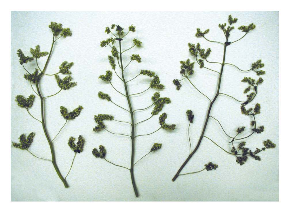
Fig. 13: Differing auxillary flower cluster types Slika 13: Različni tipi stranskih socvetij