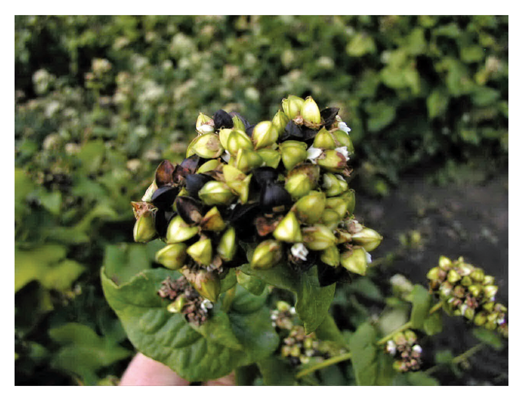
Fig. 15: Ball cluster Slika 15: Kroglasto socvetje