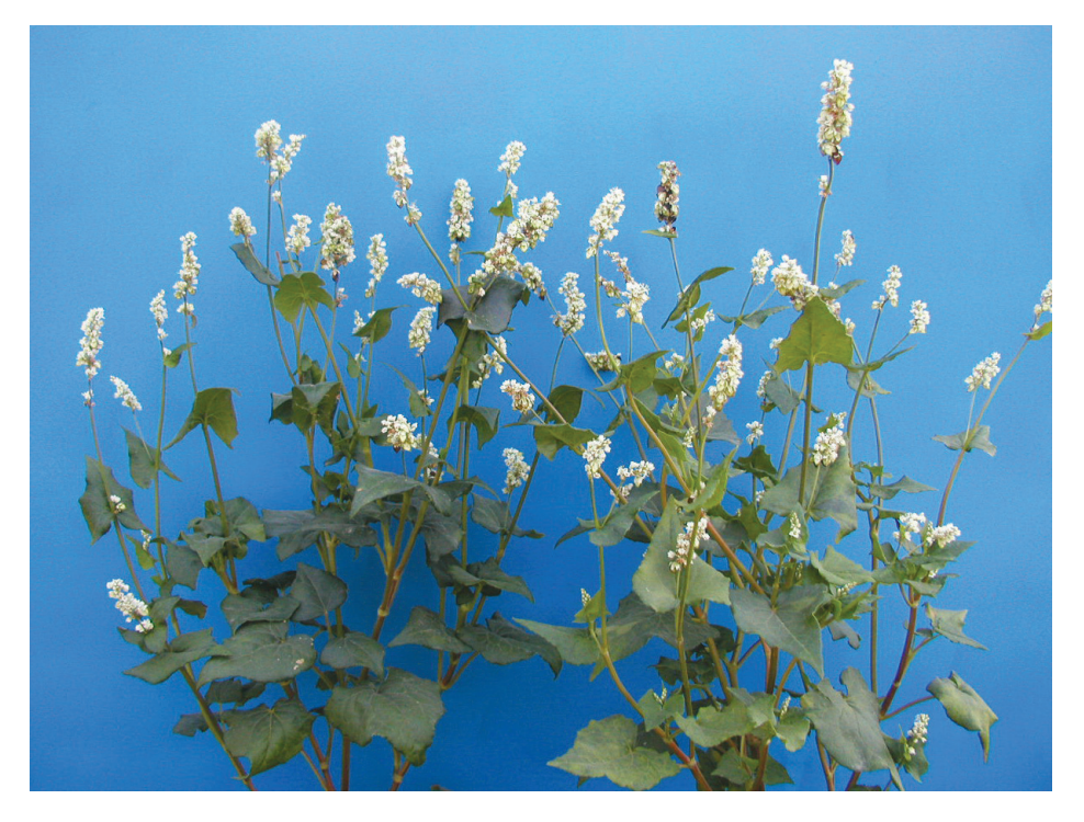
Fig. 14: Determinant flower clusters Slika 14: Socvetja ajde s končno rastjo