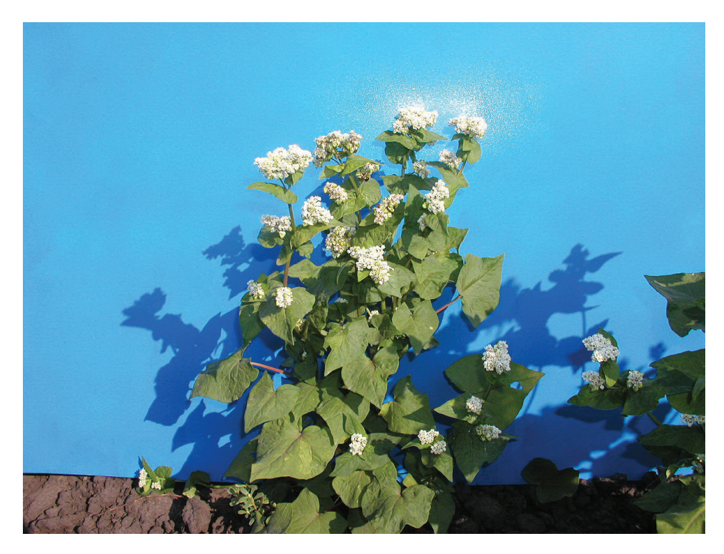
Fig. 16: Plant with ballclusters Slika 16: Rastlina s kroglastimi socvetji