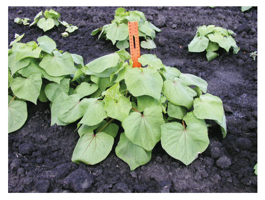
Fig. 6: Early Kiku growth Slika 6: Začetek rasti pri Kiku