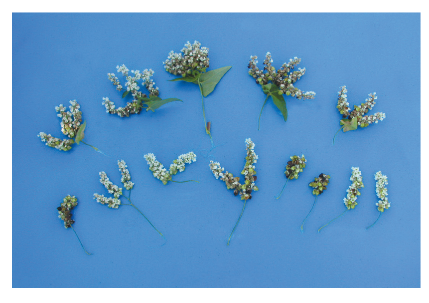
Fig. 10: Flower cluster types that have been found in common buckwheat Slika 10: Različne oblike socvetij ki smo jih ugotovili pri ajdi