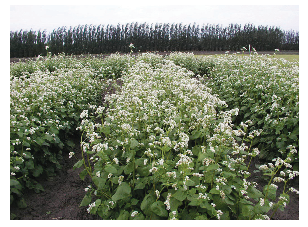
Fig. 3: Plant habit of Kiku types Slika 3: Kiku oblika rastlin