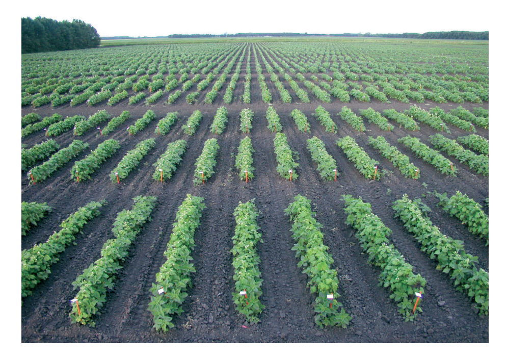
Fig. 1: Field of self pollinating buckwheat Slika 1: Polje s samooplodno ajdo

WANG, Y., CAMPBELL, C. 1998. Interspecific hybridization in buckwheat among Fagopyrum esculentum , F. homo tropicum , and F. tataricum . p. I: 1-13, Proceedings of the 7<sup>th</sup> Int. Symposium on Buckwheat, 12-14.