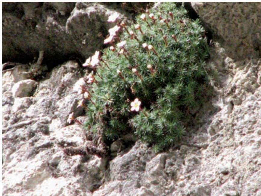
Figure 3: Burser's saxifrage - Saxifraga burseriana L. on the cliff in front of Pokljuka Cave