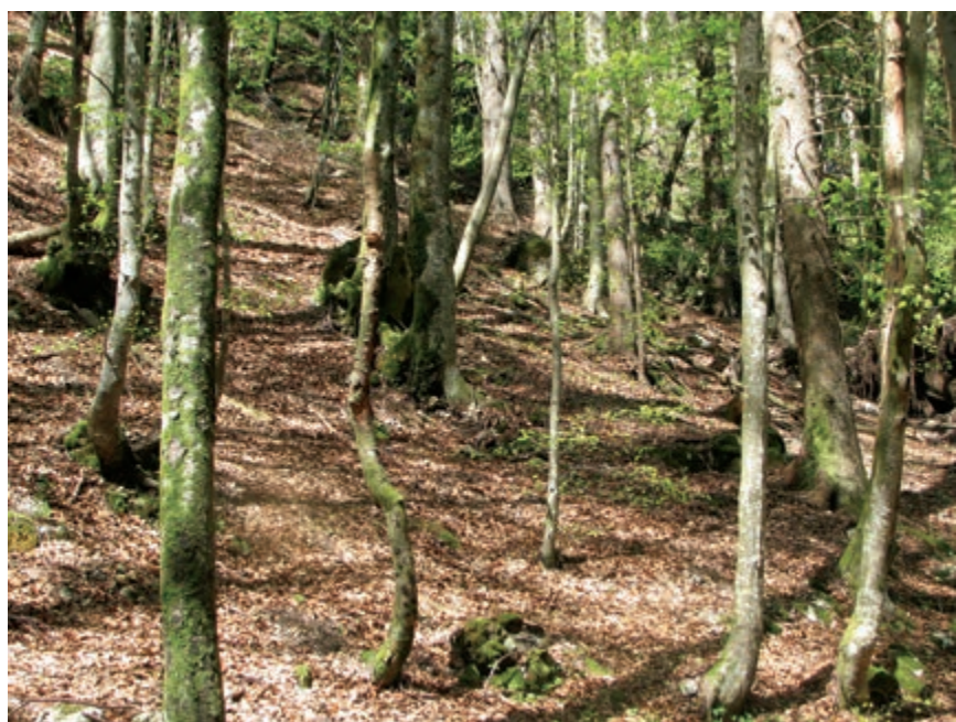
Figure 4: Pre-Alpine beech forest - Anemono-Fagetum