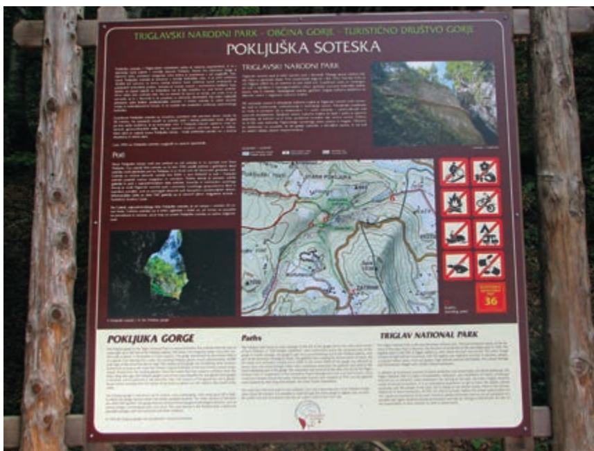
Figure 2: Notice in Jela at the entrance to Pokljuka Gorge