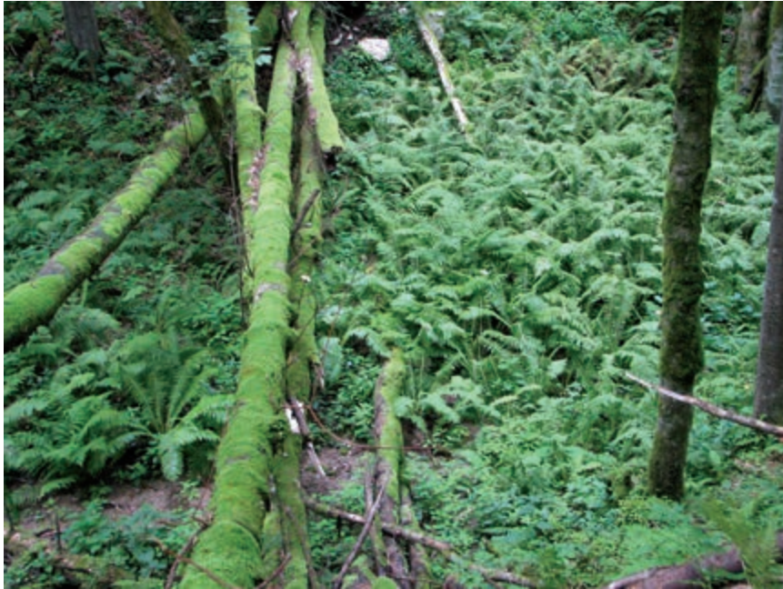
Figure 5: Ostrich fern - Matteuccia struthiopteris (L.) Tod. in sycamore-maple forest