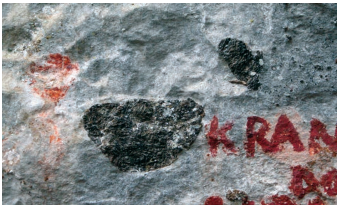
Figure 8: Cherts in Triassic limestone