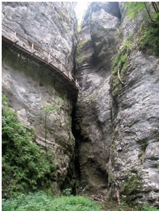
Figure 7: Bridge, called the Galleries, in Pokljuka Gorge