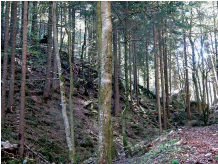
Figure 6: Sub-Alpine spruce forest - Rhytidiadelpho lorei - Piceetum